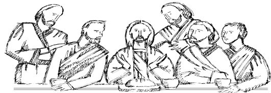
Worship Schedule for Holy Week

So hold your loved ones close today, whisper in their ear, tell them how much you love them and that you'll always hold them dear. Take time to say, "I'm sorry, please forgive me," "thank you", or "It's okay". And if tomorrow never comes, you'll have no regrets about today.