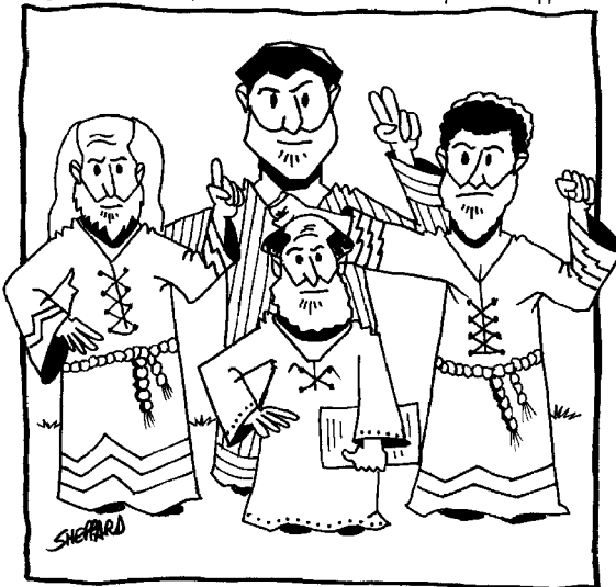
Matthew, Mark, Luke and John, the original Fantastic ④